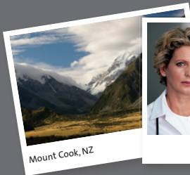
Mount Cook, NZ