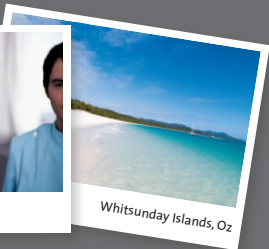
Whitsunday Islands, Oz